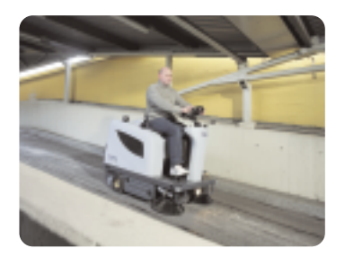
Battery and petrol versions available for indoor or outdoor cleaning. The 6km/hour speed and fantastic climbing ability (20% grade) mean first-class productivity in all operating conditions